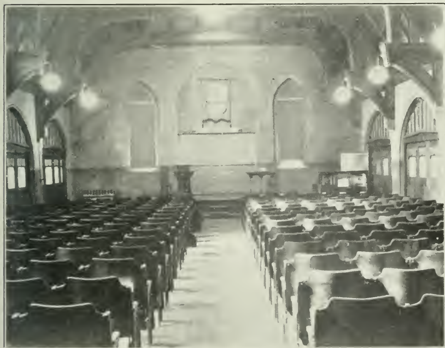
The Old Assembly Hall

Cordial Christmas and New Year Greetings To All Friends and Former Students