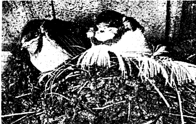
BARN SWALLOWS READY FOR TEST FLIGHT

Reduced Number of Hunters Likely to Offset Destruction by Bombs—Insect Pests Would Multiply Rapidly If Birds Didn't Regulate Them