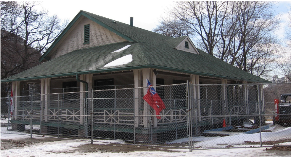
St. Matthew's Lawn Bowling Clubhouse in its new location on the west side of Broadview Avenue in Riverdale Park