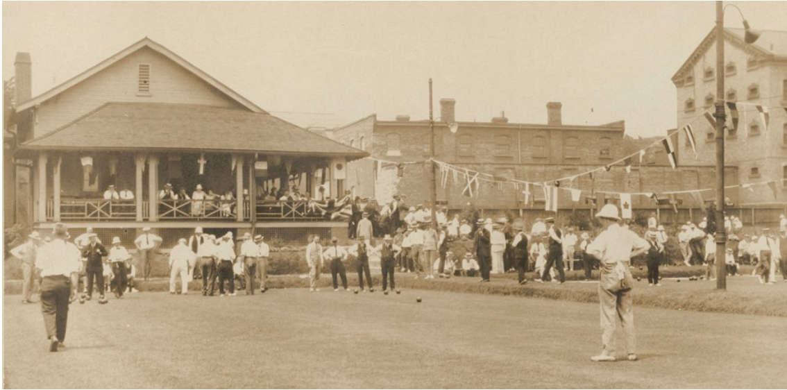
Historical photograph, showing the original location of St. Matthew's Lawn Bowling Clubhouse at 548 Gerrard Street East, west of the Don Jail.